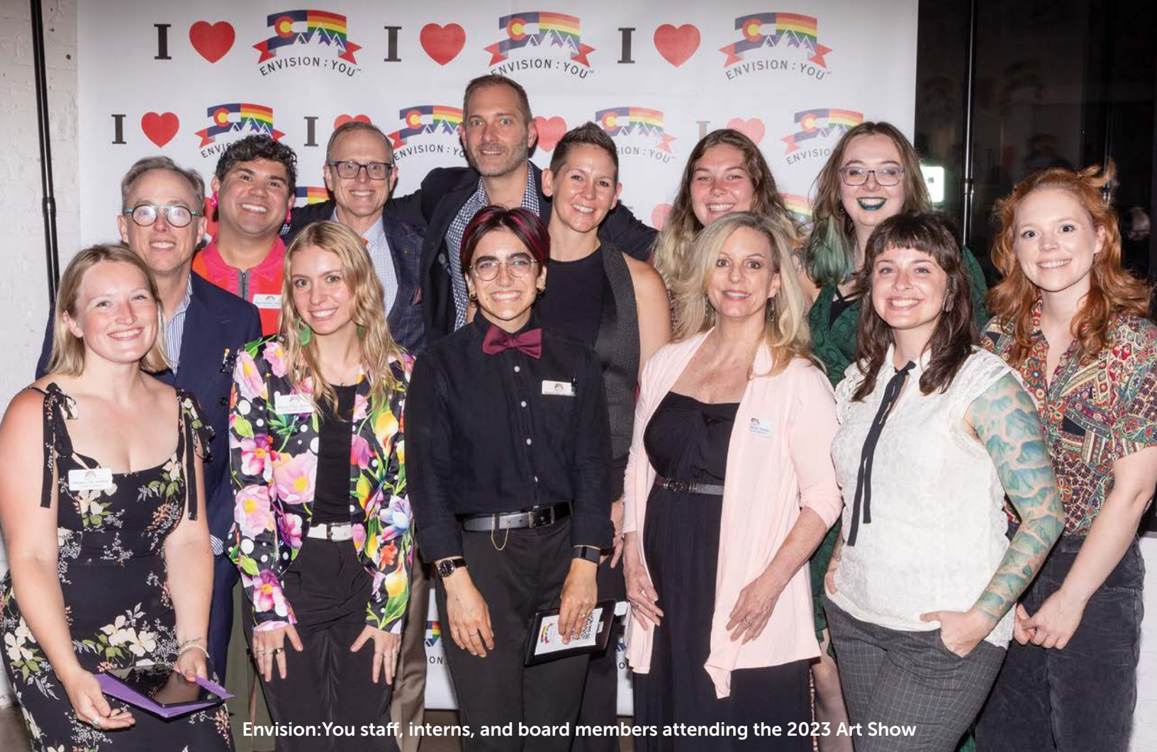
Envision:You staff, interns, and board members attending the 2023 Art Show